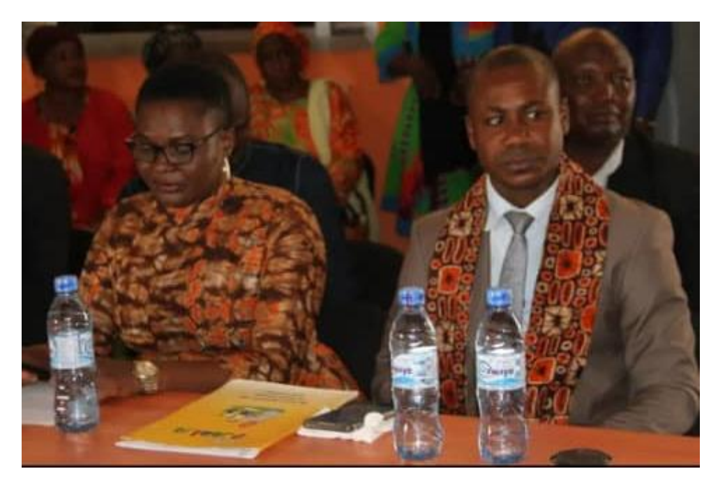
Jolly Phonics Trainer from Nigeria and Côte d'Ivoire