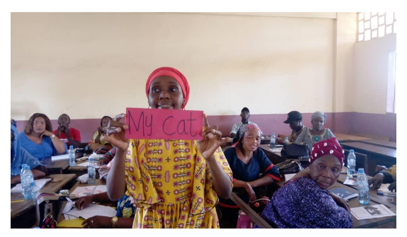
Trainee making simple phrases on cardboard