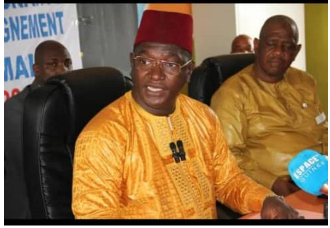
The Minister of Elementary Education and Alphabetization during his speech