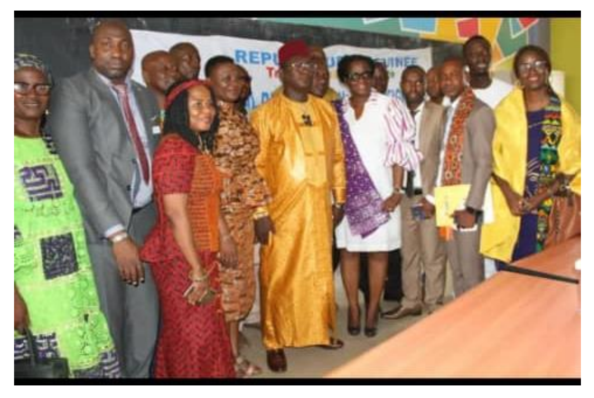
The Minister (at the center), Jolly Phonics Trainers and Minister Staff