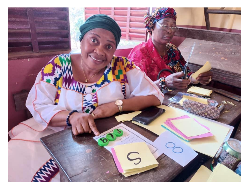
Trainee blending sounds to read the word pig