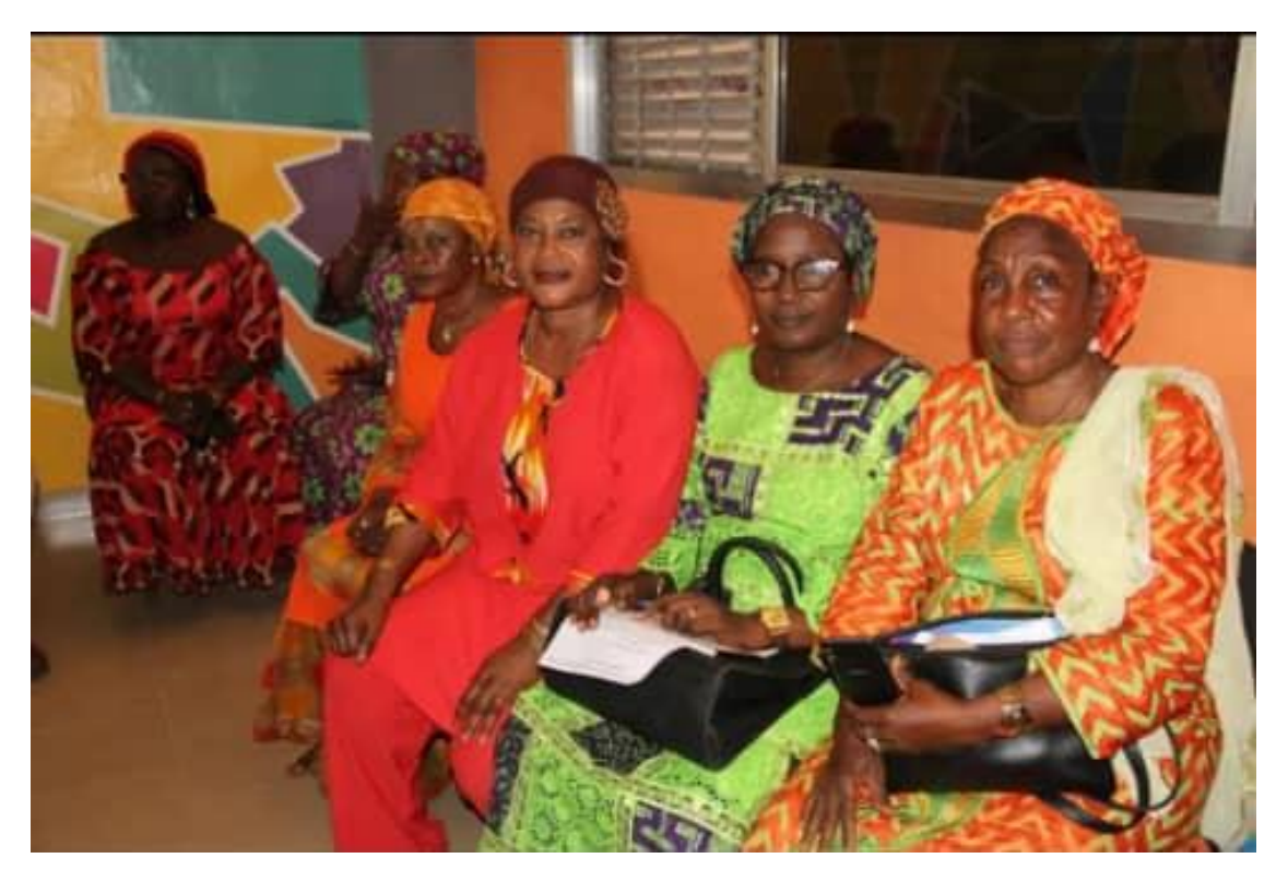
National Director's staff participating in the training