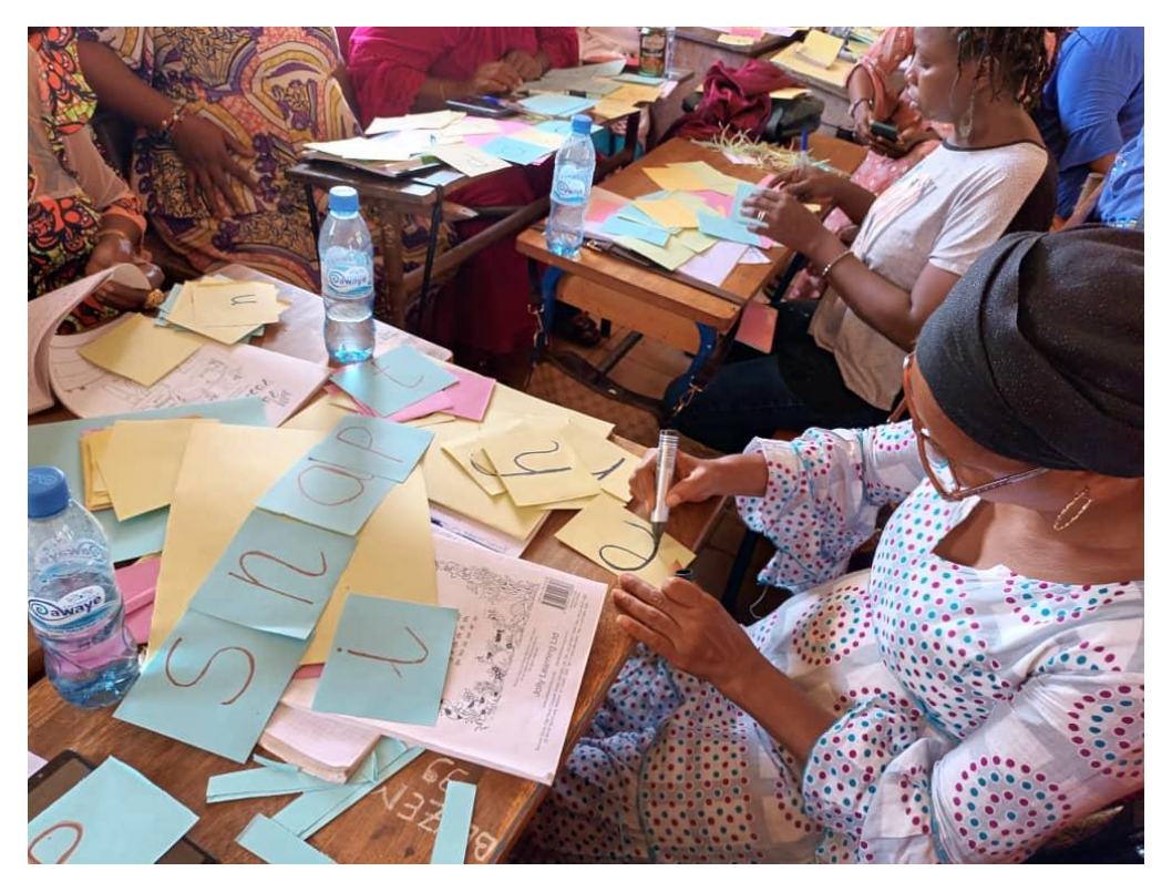
Trainee creating flashcards