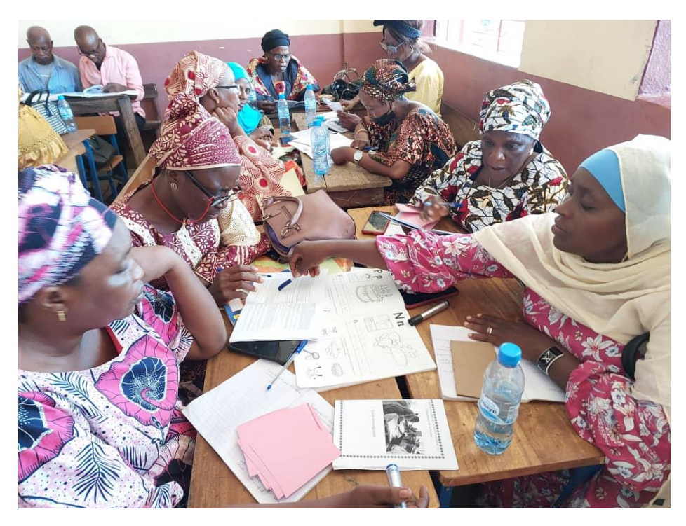
Participants discovering how to use Pupils' Book 1