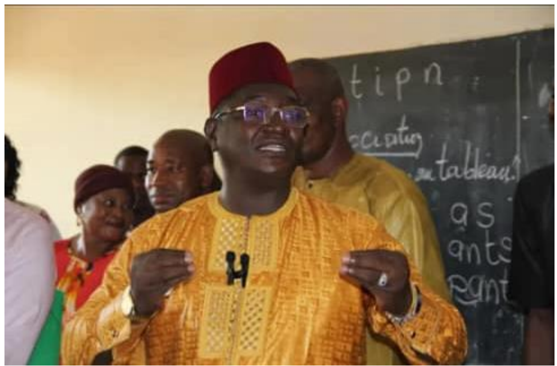
Minister encouraging participants to give in their best