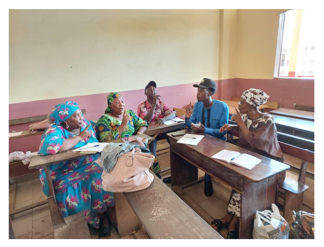
Trainees in group practicing /p/ with action