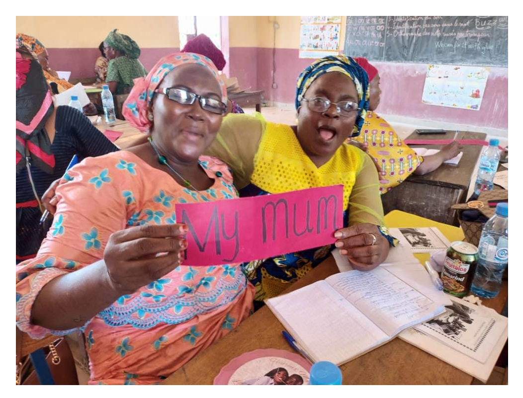
Trainees making simple phrase on cardboard