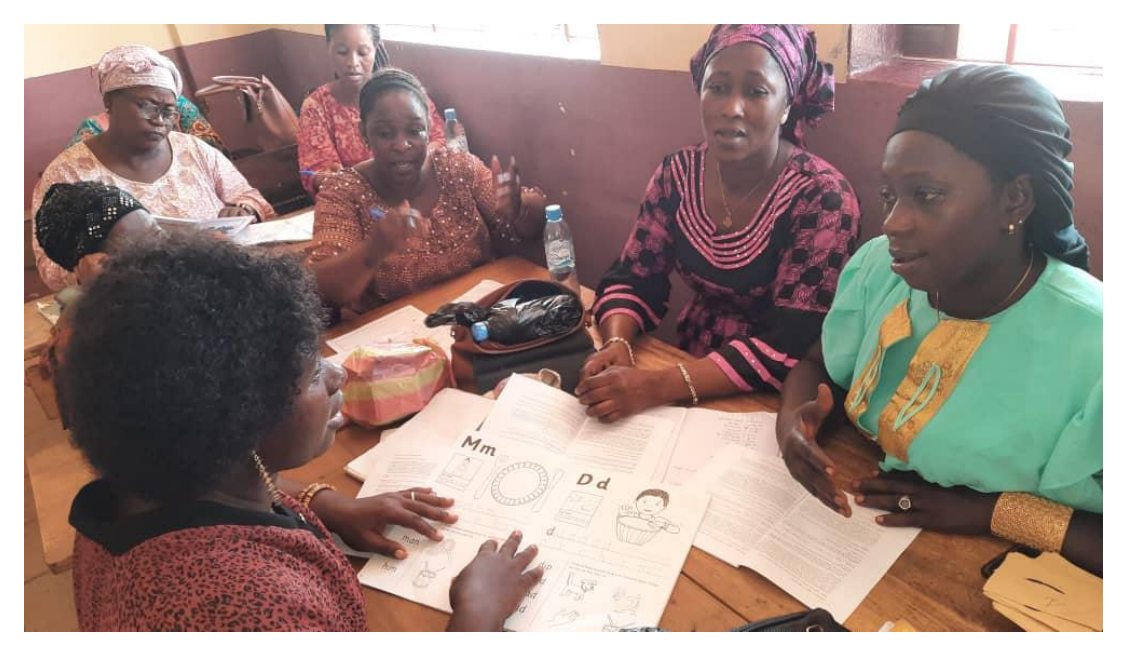
Participants in group preparing to present /d/