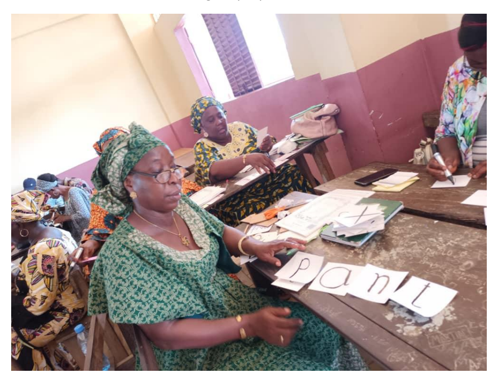
Participant blending sounds on flashcards pant