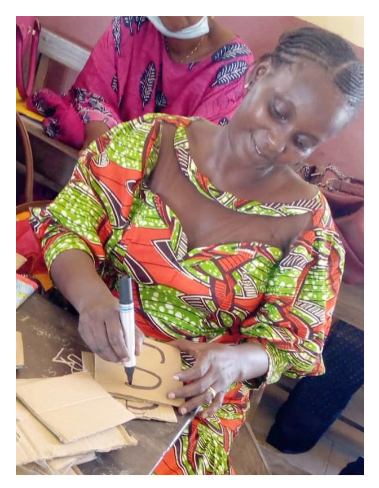
Participant creating her flashcards