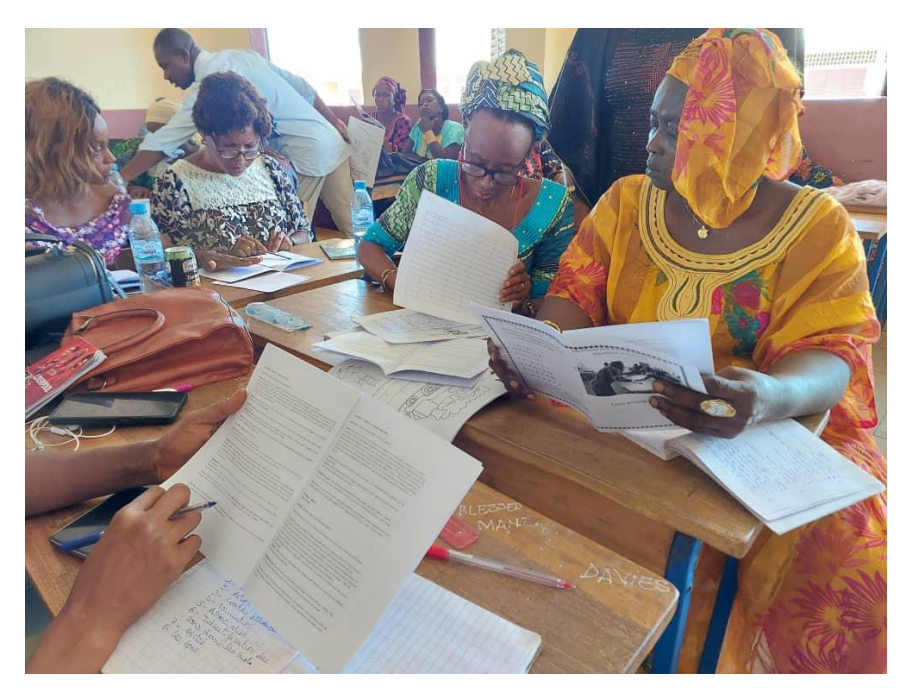
Participants getting acquainted with the French Teacher's Guide