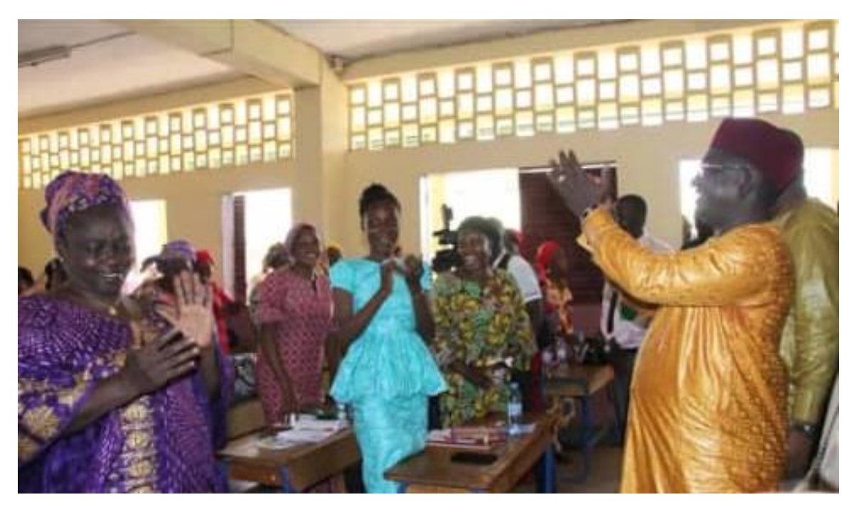
Minister addressing participants