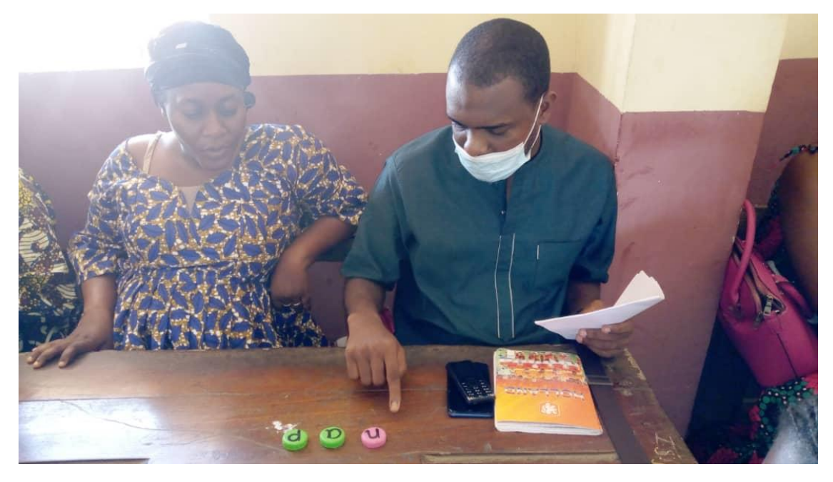
Trainees using bottle covers to blend sounds and read nap