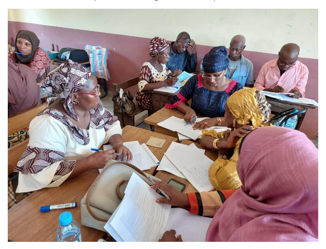
Participants group work in preparation for teaching /s/